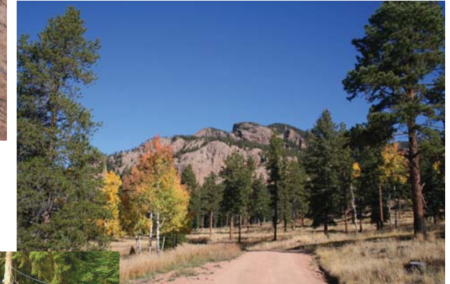
Rocks Camp - Outdoor and Climbing Education