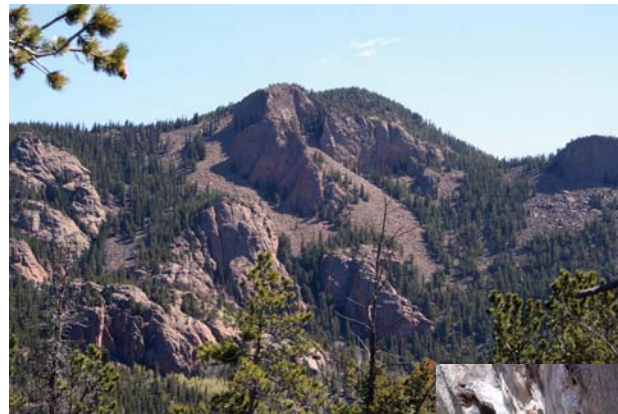
Staunton Rocks with Black Mountain in background