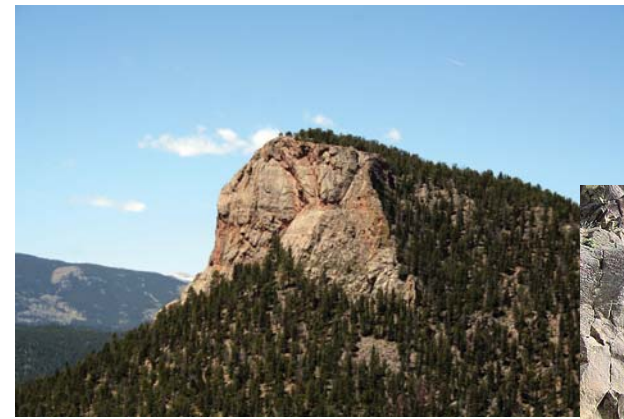
Lion's Head (potentially open seasonally)