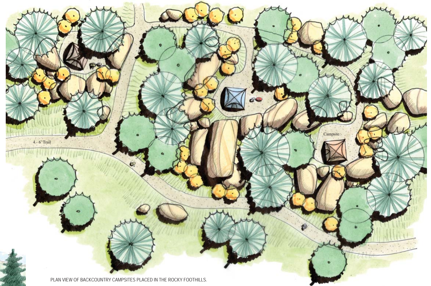
PLAN VIEW OF BACKCOUNTRY CAMPSITES PLACED IN THE ROCKY FOOTHILLS.